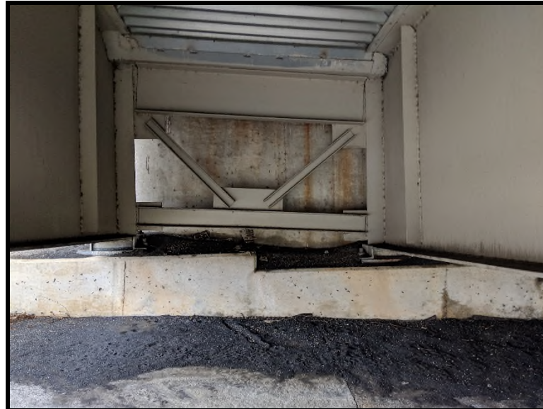
2 View of the underside of the bridge.