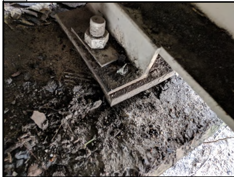
4 View of the plates located at the foot of the bridge.