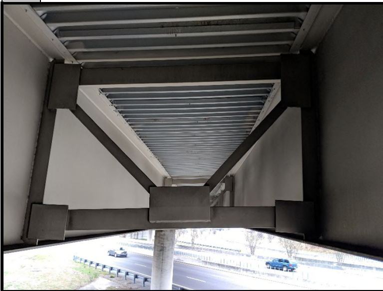
3 Additional view of the underside of the bridge.