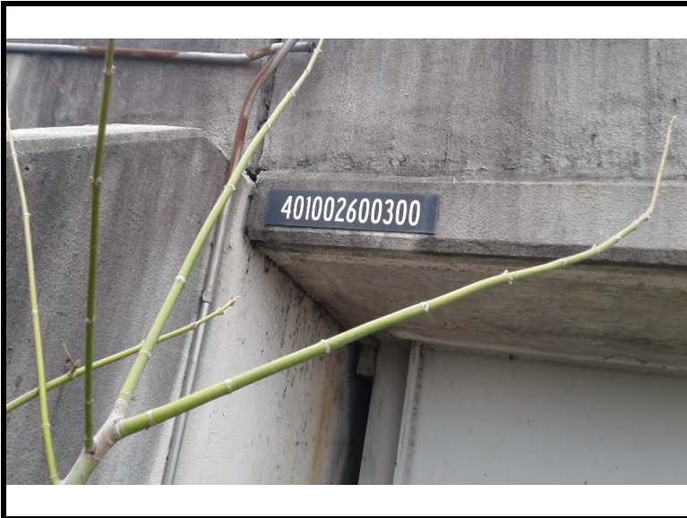
1 View of the structure number.